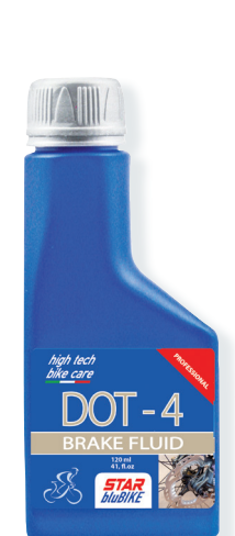
DOT 4 • 120 ml Cod. 20.029 DOT 4 • 500 ml Cod. 20.030

Fluid for bicycle hydraulic disc brake systems. High boiling point, low viscosity, working temperature up to -40°C. Excellent anti corrosion properties, high lubricating properties, excellent chemical stability. • Prevents foaming and overheating of the pump. • Compatible with DOT 3