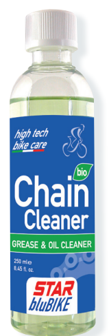
BIO CHAIN CLEANER • 250 ml Cod. 20.011

BIO CHAIN CLEANER is a liquid grease cleaner obtained from natural extracts, over 95% biodegradable, ideal for bike chains and oil or grease lubricated parts. • Clean bike chains using brush or by adding required quantity to special CLEAN MACHINE. • This product, when conserved correctly in original bottle, maintains degreasing characteristics for two years.