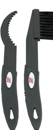
BRUSH KIT Cod. 20.049