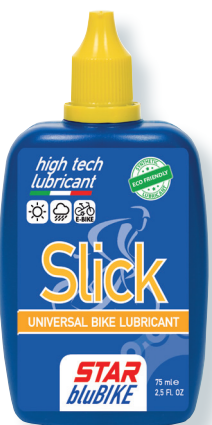
SLICK • 75 ml Cod. 20.000

SLICK is a universal synthetic lubricant with a medium viscosity containing special additives that protect against wear and rust, indicated for lubricating all bike parts. SLICK eliminates noise and protects all mechanical parts from humidity and corrosion. • This product is ECO FRIENDLY obtained from non-petroleum based renewable raw materials. • SLICK is ideal for those who use their bike daily or during free time. SLICK is ideal for all types of bicycles and in all weather conditions.