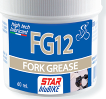
FORK GREASE • 60 ml. Cod. 20.048

FG12 is lithium-free special grease for lubricating shock absorber and fork. Lubricates, protects, and maintains your forks in perfect efficiency.