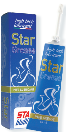
STAR GREASE • 60 g. Cod. 20.007

STAR GREASE is a synthetic lubricant based with PTFE, formulated for professional use with a very low friction coefficient, exceptional thermal stability, long lasting, good weather resistance. • STAR GREASE is suggested for bearings, hubs, headsets, bottom brackets suspension or during assembly. • Consistency: NLGI 1. Temperature Range: -30°C until +150°C