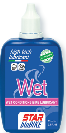
WET • 75 ml Cod. 20.001

Wet is a high viscosity synthetic lubricant with a low friction coefficient. The special additives provide excellent adherence to metal parts and reduce rusting and wear. Wet guarantees long lasting lubrication. • This product is ECO FRIENDLY obtained from non-petroleum based renewable raw materials. • This chain lubricant is ideal for long distances and tough riding conditions especially with high humidity or rain.