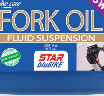
FORK OIL 15W • 500 ml Cod. 20.040

Low viscosity synthetic fluid formulated for bicycle fork suspension and shock. Excellent anti corrosion properties, high lubricating properties, excellent chemical stability. • Prevents foaming and overheating of the pump. Will not corrode gaskets and plastic parts.