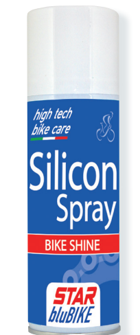
SILICON • 200 ml Cod. 20.008

SILICON SPRAY protects all metal, carbon, and plastic parts of bicycles from dust, dirt, and water. • SILICON SPRAY leaves a protective film that helps maintain clean and dry all treated parts. SILICON SPRAY can also be used to lubricate and protect chains, bearings and suspensions. • Avoid contact with brakes.