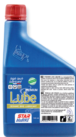
PREMIUM LUBE • 500 ml Cod. 20.037