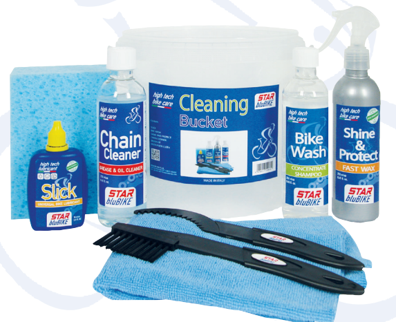
CLEANING BUCKET Cod. 20.060