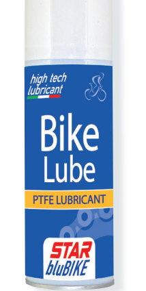
BIKE LUBE • 200 ml Cod. 20.009

BIKE LUBE PTFE is a high quality spray lubricant. The PTFE and other special additives reduce friction, eliminates noise, makes gear changing fast and fluid, and protects all mechanical parts from use and corrosion. • BIKE LUBE PTFE penetrates into the chain easily and leaves a non adhesive film that protects against dirt and dust. • This product is ideal for fast and easy lubricating.