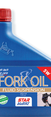
FORK OIL 5W • 500 ml Cod. 20.038

A synthetic hydraulic fluid formulated for bicycle fork suspension and shock. • This product is ECO FRIENDLY obtained from non-petroleum based renewable raw materials. • Excellent damping performance at both high and low temperatures. Rapid incorporated air release, maximum protection against wear and corrosion.