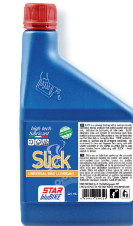
SLICK • 500 ml Cod. 20.035

CHAIN CLEANER SPRAY rapidly cleans and degreases bicycle chain. This product will not harm paint or parts in plastic or in carbon fiber. • Flammable product. Do not use near open flame. • Retubricate carefully after every cleaning operation.