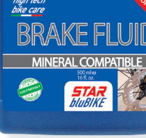
BRAKE FLUID • 500 ml. Cod. 20.057

Low viscosity synthetic fluid formulated for bicycle hydraulic brakes. Assure maximum life of brakes with excellent performance in a wide temperature range. This product is 100% compatible with DOT Fluids. • This product is ECO FRIENDLY obtained from non-petroleum based renewable raw materials. • Prevents foaming and overheating of the pump. Will not corrode gaskets and plastic parts.