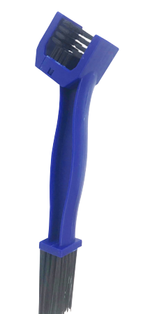
CHAIN BRUSH Cod. 20.058