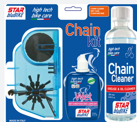
CHAIN KIT Cod. 20.013