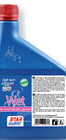
WET 10/40 • 500 ml Cod. 20.033