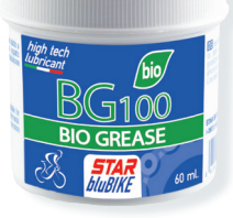
BIO GREASE • 60 ml. Cod. 20.046

Multifunctional, biodegradable vegetable source grease for lubricating all parts of the bicycle. This grease promotes low environmental impact while ensuring excellent stability, anti-oxidation and corrosion properties.