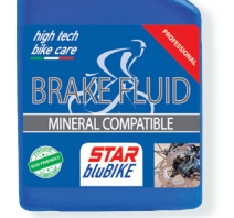
BRAKE FLUID • 120 ml. Cod. 20.056

Low viscosity synthetic fluid formulated for bicycle hydraulic brakes. Assure maximum life of brakes with excellent performance in a wide temperature range. This product is 100% compatible with DOT Fluids. • This product is ECO FRIENDLY obtained from non-petroleum based renewable raw materials. • Prevents foaming and overheating of the pump. Will not corrode gaskets and plastic parts.