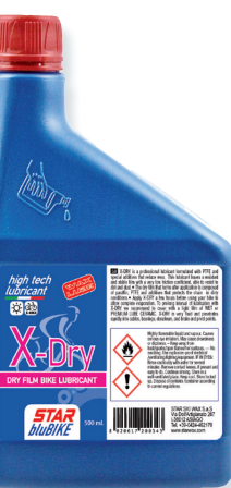
X-DRY • 500 ml Cod. 20.034