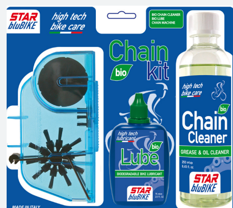
BIO CHAIN KIT Cod. 20.014