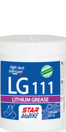
LITHIUM GREASE • 150 g. Cod. 20.005 • 500 g. Cod. 20.006

Multi-purpose lithium grease with special additives, offers high pressure load resistance and good response at high temperatures guaranteeing strong water repellent characteristics, corrosion and wear resistance. • This product is ECO FRIENDLY obtained from non-petroleum based renewable raw materials.