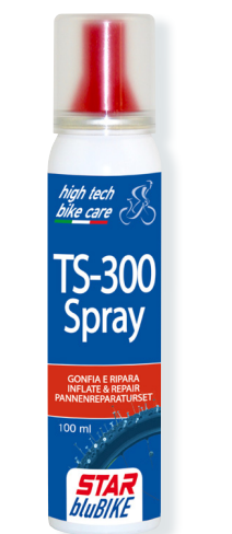
INFLATE & REPAIR • 100 ml Cod. 20.023

The contents of this aerosol will repair and inflate for a fast tire puncture repair. • Push the adapter onto the tire valve and inflate until the puncture is completely closed. NEVER use near open flames or on incandescent bodies. • Inform the tire repairer of the use of this product.