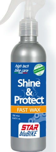
BIKE SHINE • 250 ml Cod. 20.055

Carnauba wax based protection and polish for the bicycle frame. Leaves a non-adhesive glossy film that protects the paint from dirt. It does not alter the plastic and carbon parts. Also excellent for polishing helmets. • Shake the bottle vigorously and spray on clean surface. • Dry and polish with a microfibre cloth.