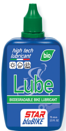
BIO LUBE • 75 ml Cod. 20.003

BIO LUBE is a natural lubricant, over 95% biodegradable, studied specifically to lubricate and protect chains and any other part of your bicycle. BIO LUBE will not harm the environment and protects metal parts from rust and wear in all weather conditions. • This chain lubricant is for the cyclist that loves nature and excursions in parks and reserves ecologically protected. • Apply this product to clean, dry chain while turning the pedals. Avoid contact with brakes.