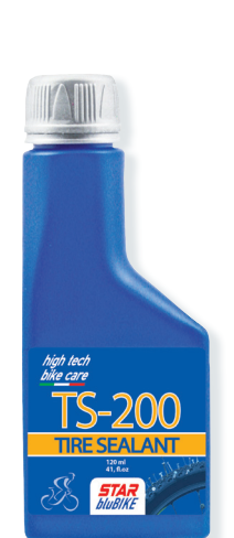
TIRE SEALANT • 500 ml Cod. 20.022 120 ml Cod. 20.041

TS200 instantly seals tubeless and non-tubeless up to 5 mm. punctures. • Shake the bottle and add sealant through valve stem with removable core or dismount and pour directly into the tire. • TS200 remains liquid for 2-5 months. Active up to -15°C.