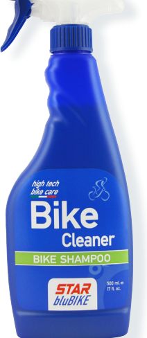
BIKE CLEANER • 500 ml Cod. 20.012

BIKE CLEANER is a surfactant soluble in water which removes all types of dirt and grime. This product will not harm paint or parts in plastic or in carbon fiber. • Pump spray BIKE CLEANER directly on all dirty parts, wait a few minutes, then rinse with water. • For best results use Shine & Protect after cleaning.