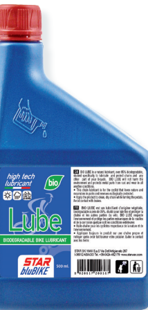
BIO LUBE • 500 ml Cod. 20.036