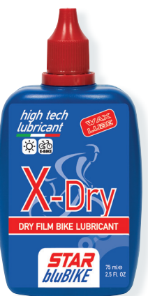
X.DRY • 75 ml Cod. 20.002

X-DRY is a professional lubricant formulated with PTFE and special additives that reduce wear. This lubricant leaves resistant and stable film with a very low friction coefficient, able to resist to dirt and dust. • The dry film that forms after application is composed of paraffin, PTFE and additives that protects the chain in dry conditions. • Apply X-DRY a few hours before using your bike to allow complete evaporation.