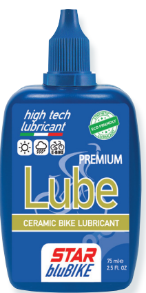
PREMIUM LUBE • 75 ml Cod. 20.112

PREMIUM LUBE CERAMIC is a new generation of synthetic oil enhanced with CERAMIC particles that assure the maximum in long lasting lubrication even in extreme conditions. The use of particular additives renders all moving parts particularly silent and protects from dirt. • This product is ECO FRIENDLY obtained from non-petroleum based renewable raw materials. • Shake well before using to permit the solid particles in suspension to disperse evenly.