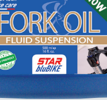
FORK OIL 10W • 500 ml Cod. 20.039

Low viscosity synthetic fluid formulated for bicycle fork suspension and shock. Excellent anti corrosion properties, high lubricating properties, excellent chemical stability. • Prevents foaming and overheating of the pump. Will not corrode gaskets and plastic parts.