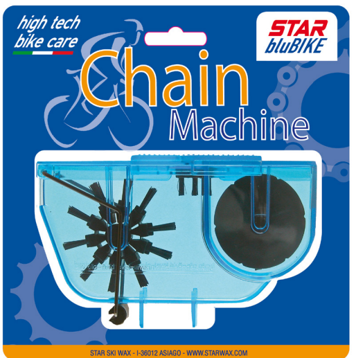
CHAIN MACHINE Cod. 20.016