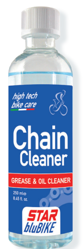
CHAIN CLEANER • 250 ml Cod. 20.010

CHAIN CLEANER is an odorless grease cleaner not delutable in water, ideal for bike chains and all oil or grease lubricated parts. • Clean bike chains using brush or by adding required quantity to special CLEAN MACHINE. • Relubricate carefully after every cleaning operation.