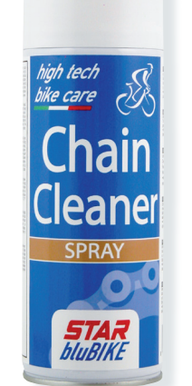
CHAIN CLEANER SPRAY • 400 ml Cod. 20.050

CHAIN CLEANER SPRAY rapidly cleans and degreases bicycle chain. This product will not harm paint or parts in plastic or in carbon fiber. • Flammable product. Do not use near open flame. • Retubricate carefully after every cleaning operation.