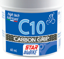
CARBON GRIP • 60 g. Cod. 20.047

C10 is used to create friction between two surfaces. Indispensable for assembling carbon bicycle parts allowing less tightening. C10 can cause slight abrasions at the contact points. This is a normal condition to allow a good seal.