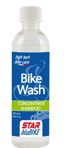
BIKE WASH • 250 ml Cod. 20.054

Bike Wash is a concentrated biodegradable and neutral bike cleaner, ideal for deep washing bicycles. Respects all plastic and carbon parts. • Add 5 cups of Bike Wash for 5 liters of water to create cleaning foam. • Use sponge or brush, rinse, and dry with a cloth.