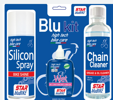
BLU KIT Cod. 20.015

STAR BLUBIKE BY STAR SKIWAX Via Dell' Artigianato 267 • 36012 Asiago • ITALY • TEL. +39-0424-462179 • www.starwax.com