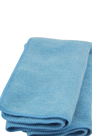
MICROFIBRE CLOTH Cod. 20.053