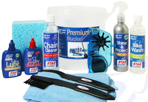
PREMIUM BUCKET Cod. 20.061

All BLUBIKE products are E-BIKE compatible.